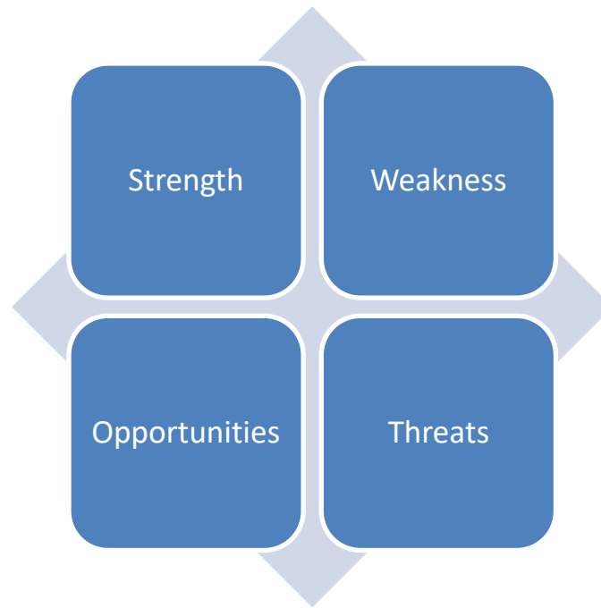
Figure 2: Components of SWOT analysis