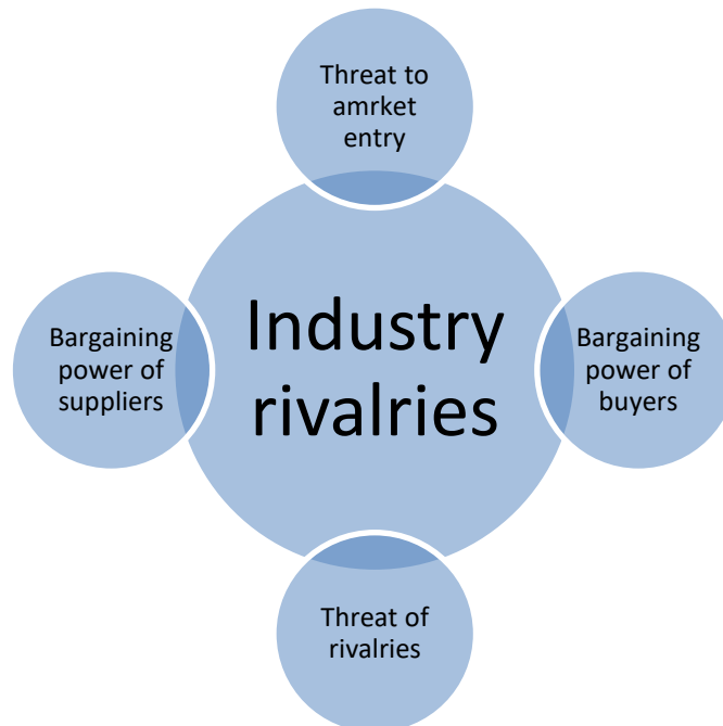
Figure 3: Porter's five force model

Industry rivalry is highly competitive in the market because it their number of businesses that are operating in the industry. Samsung is facing high competition from brands like LG, Apple, etc. It means company need to focus on decision making according to consideration of competitors practice. Overall development must be taken into account as per an analysis of its competitors to meet outcome (Smith, 2014)