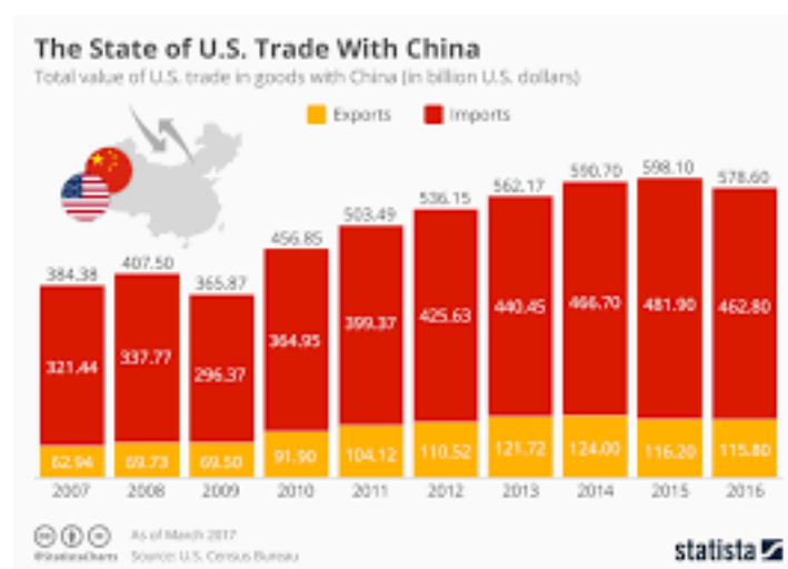
Fig 1: State of US trade with China

However, this is just the tip of the ice-berg. The situation is far worse than thought of and getting completely out of hand. The market in both the countries has been affected a lot, however the major impact has been suffered by China.