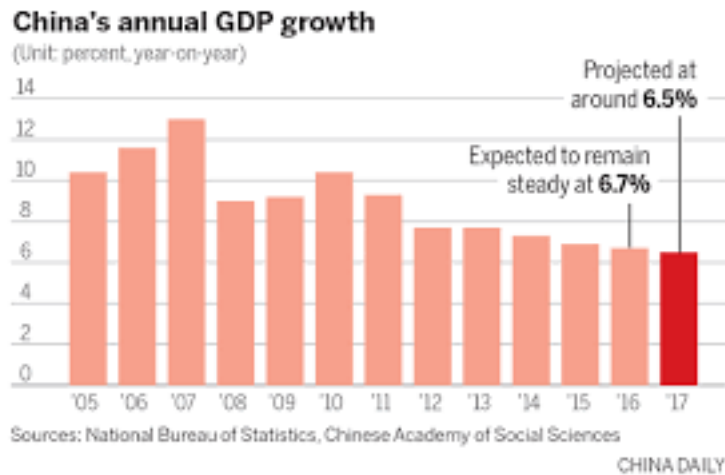
Fig2: China GDP